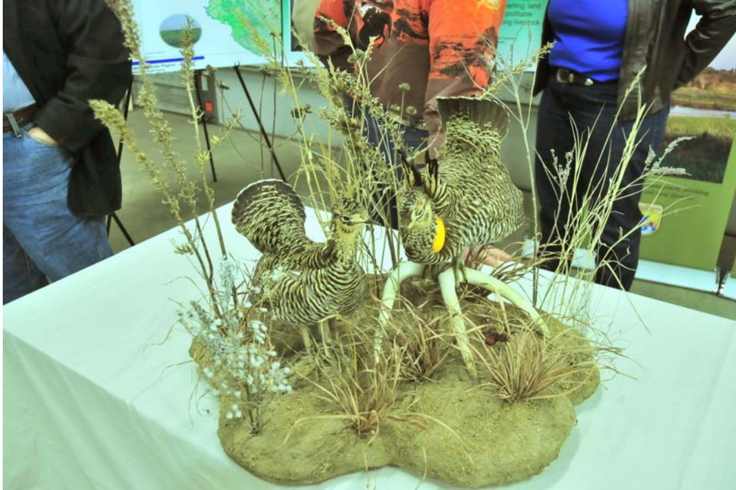
Photo: Prairie chicken mount presented to Secretary of the Interior, Ken Salazar, on behalf of SDTWS and the South Dakota Grassland Coalition.